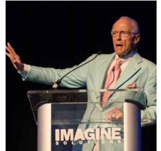
Robin Cook is the renowned author of 33 books and is known as the dean of medical mysteries with over 100,000,000 copies sold.

Searching For Solutions Institute is a public 501(c)(3) foundation in southwest Florida that provides seasoned leaders across North America with the structure and mechanisms to address critical societal needs via The Imagine Solutions Conference, an annual forum that brings up to 50 world-class thought leaders to engage an audience of 500 private sector leaders on today's most relevant issues. With a global perspective, national focus and ability to implement at a local level, the conference links learning with leadership.